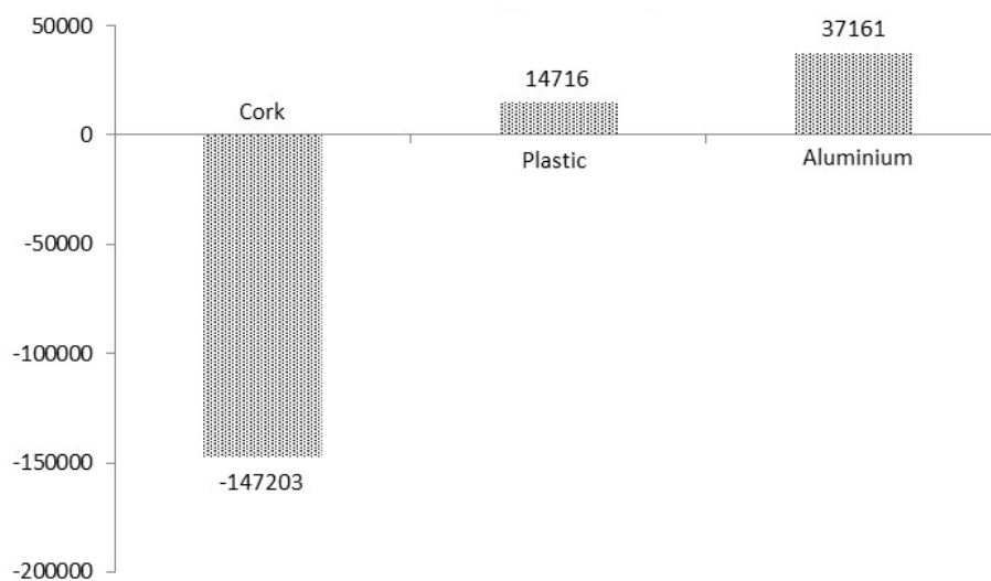
Chart 2 – Carbon sink per closure