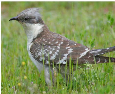
GREAT SPOTTED CUCKOO

Among the bird species normally found in the montado are kestrels, little owls, southern grey shrikes, black-winged kites, Iberian imperial eagles, black vultures, great spotted cuckoos and black storks, of which there are only 83 - 96 pairs in Portugal.